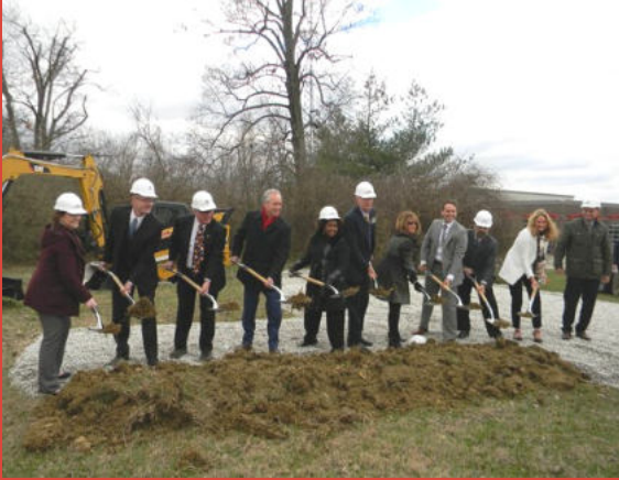
Middletown Apartments Ground Breaking March 7, 2018